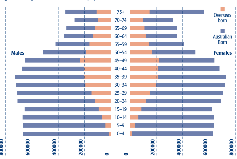
Figure 4: Age-sex distribution of population, Australia, 1996